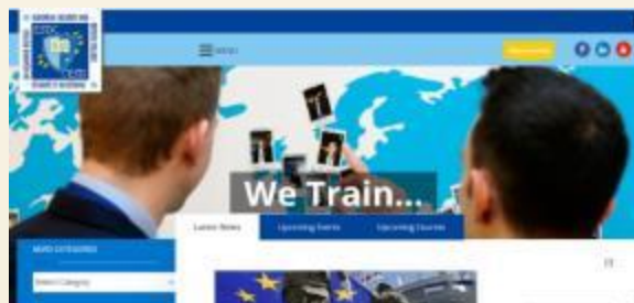
ESDC Brussels (EU)