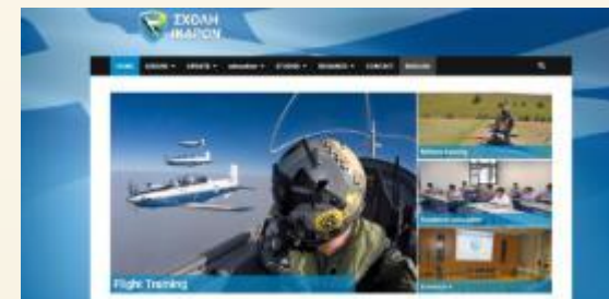
HAFA Athens (GR)