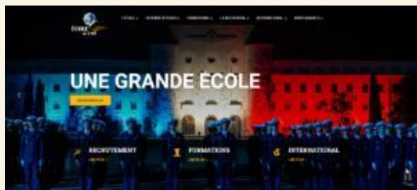
FAFA Salon de Provence (FR)

Implementation of the Erasmus+ KA2 Project EUCTSDS (2020-2023): 2020-1-RO01-KA203-080375 European Common Technical Semester for Defence and Security