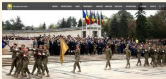
MTA Bucharest (RO)