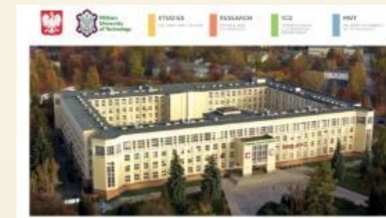
MUT Warsaw (PL)